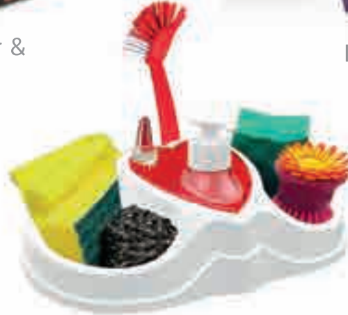
Love Dish Washing Set