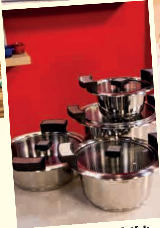
Steel kettle set Aker Mutfak