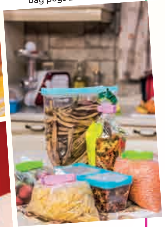
Storage containers Rositell Bag pegs Lux Plastic