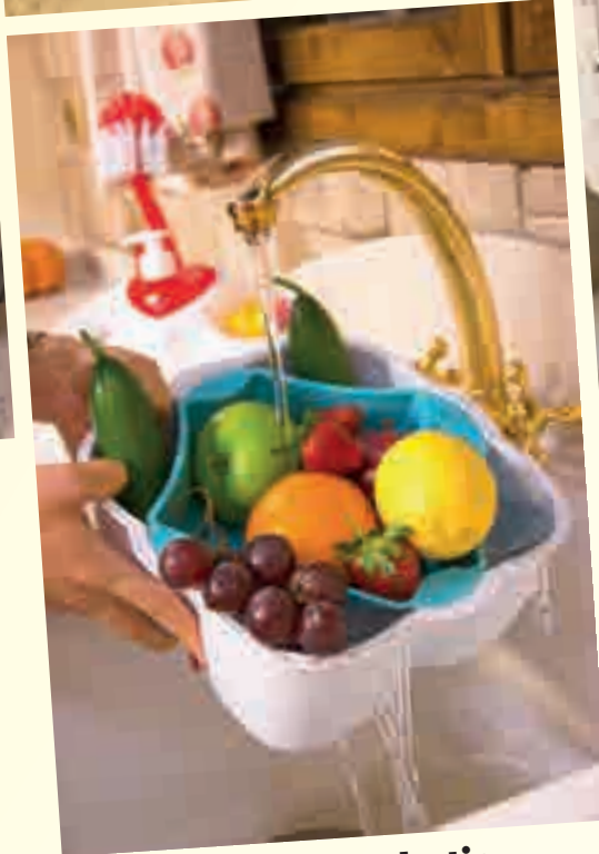
Strainer Lux Plastik