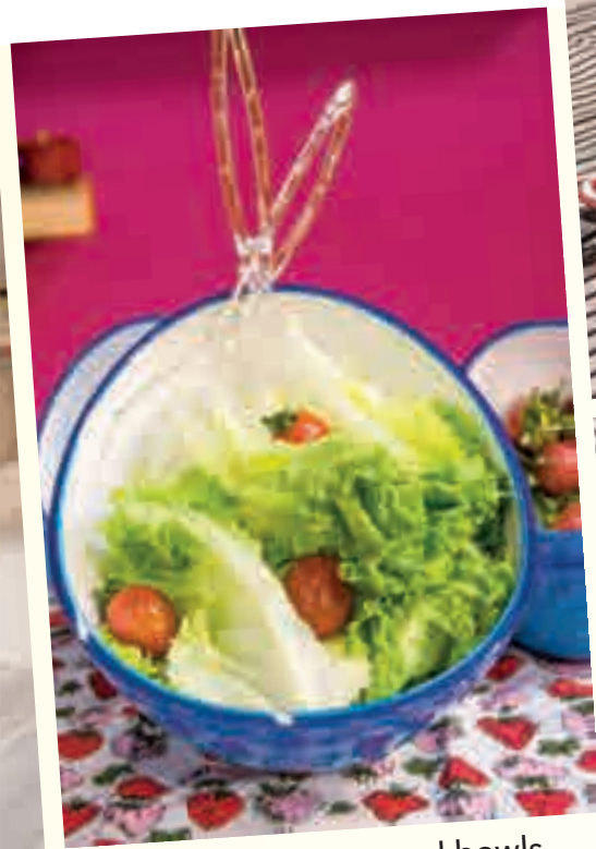
Salad mixing pot and bowls Obje Plastik