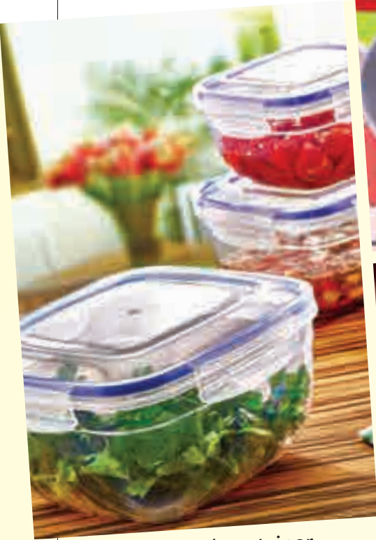
Glass food container Dünya Plastik