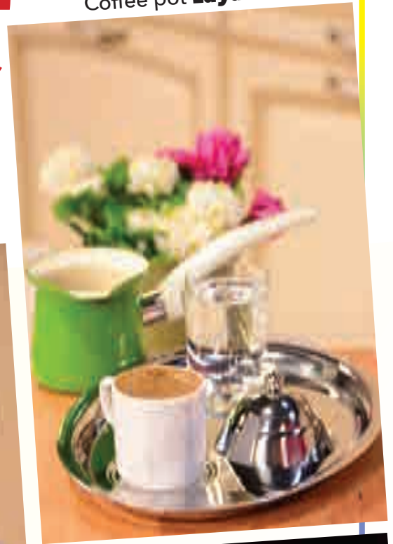
Turkish coffee set Narin Metal Coffee pot Luyano