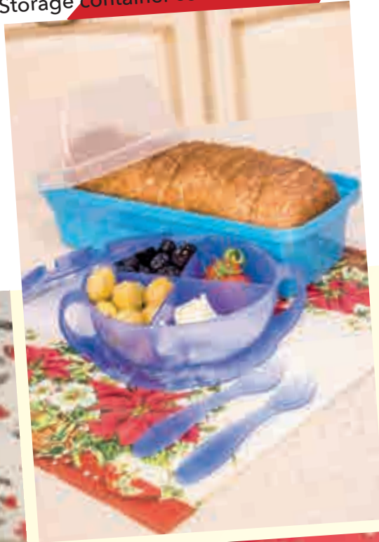
Bread bowl Lux Plastic Storage container set Mete Plastik