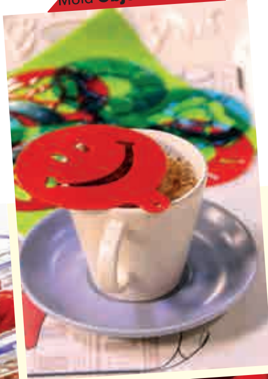
Coffee cup Tantitoni Mold Obje Plastik