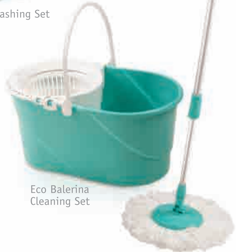
Eco Balerina Cleaning Set