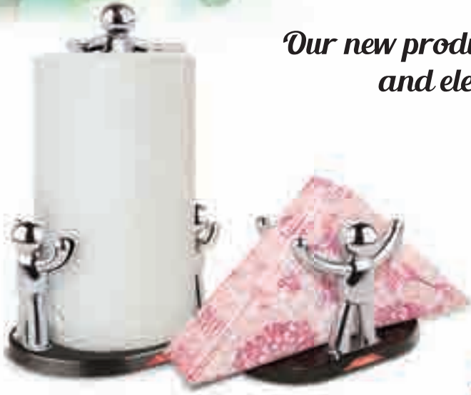
Mister Paper Towel Dispenser & Mister Napkin Holder

Our new products with high quality and elegant designs.