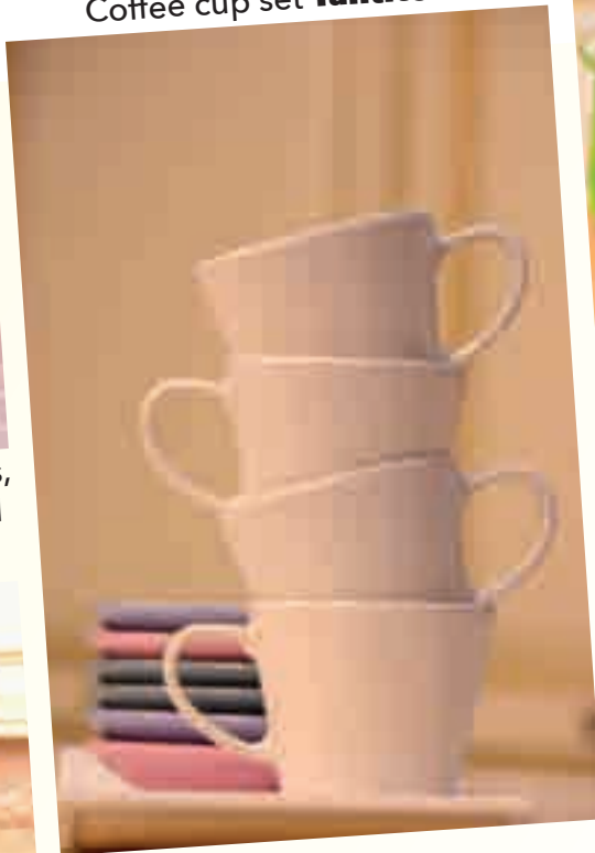
Coffee cup set Tantitoni