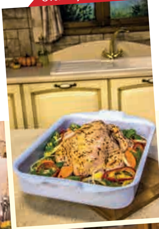
Oven tray Nouval