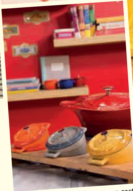
Red cast iron kettle, threesome cast iron oven ware set Lava