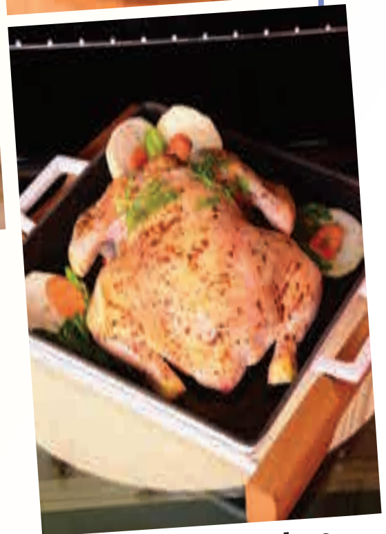
Cast iron ovenware Lava