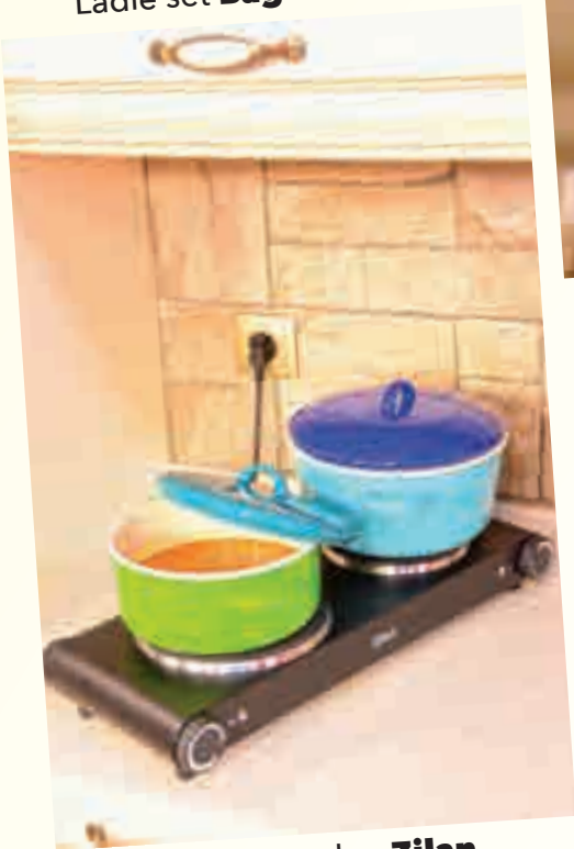
Electric cooker Zilan Pots Luyano