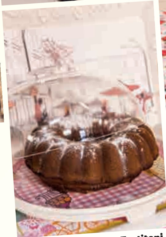
Lidded cake container Tantitoni