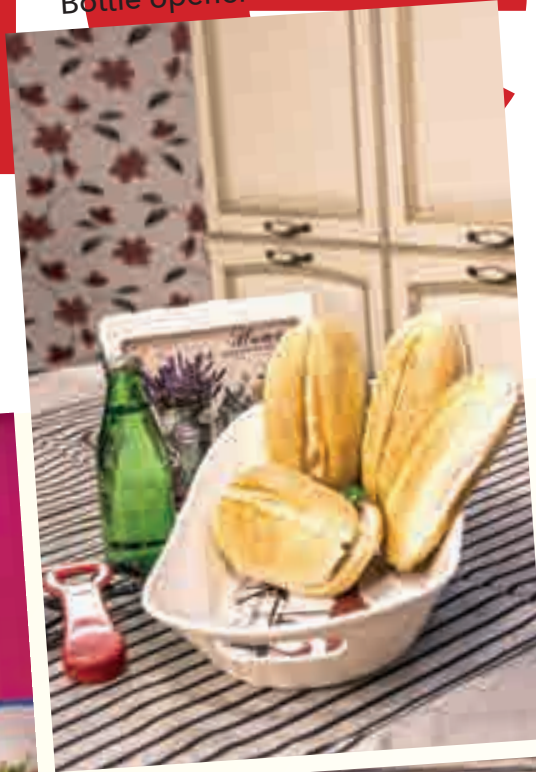
Bread box, napkin holder Göreme Melamin Bottle opener Lux Plastic