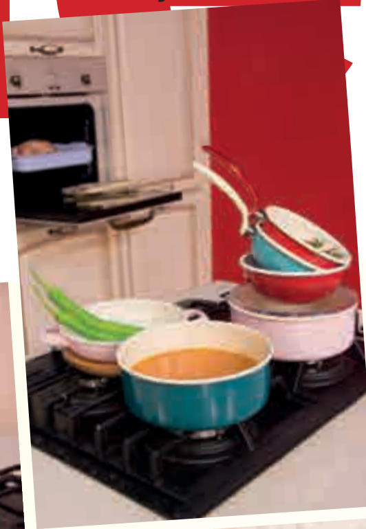
Enamel set in different sizes Luyano