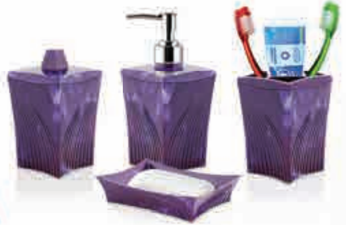
Diva Bathroom Set