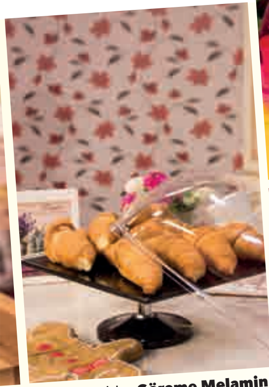
Napkin holder Göreme Melamin Floor lantern Zicco