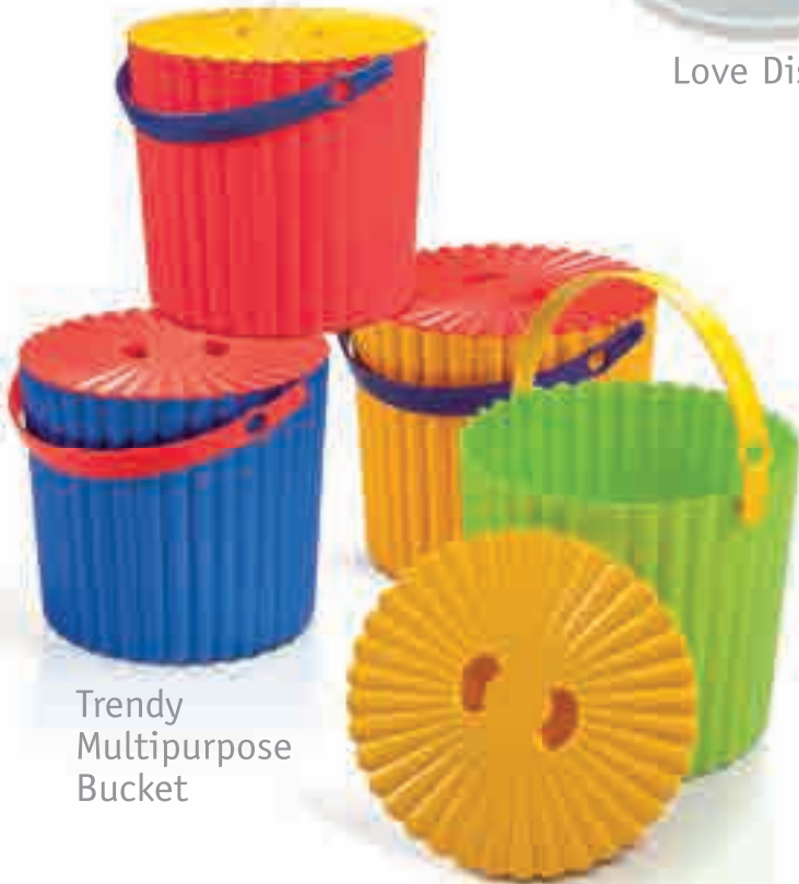
Trendy Multipurpose Bucket