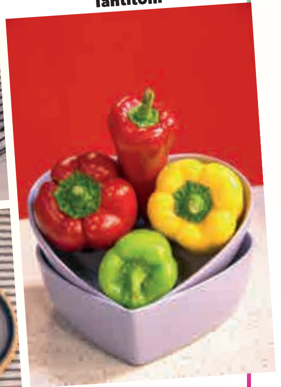
Heart shaped ovenware Tantitoni