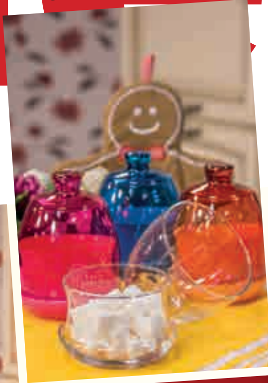
Glass sugar bowls Lav