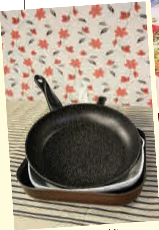
Grizzled pan white, Grizzled pan- black Papilla Square pan Savaşan Emaye