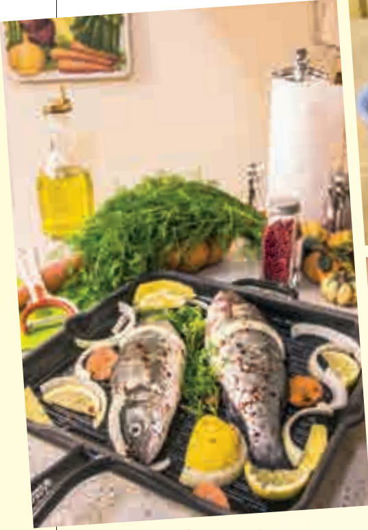
Cast iron pan Silver