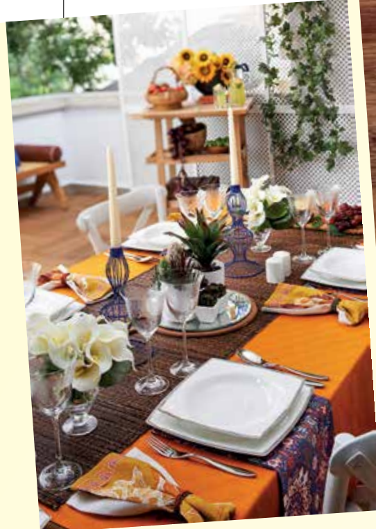
Vitality dinnerware Bernardo