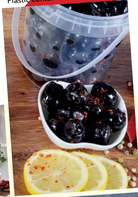
Plastic containers Mete Plastik