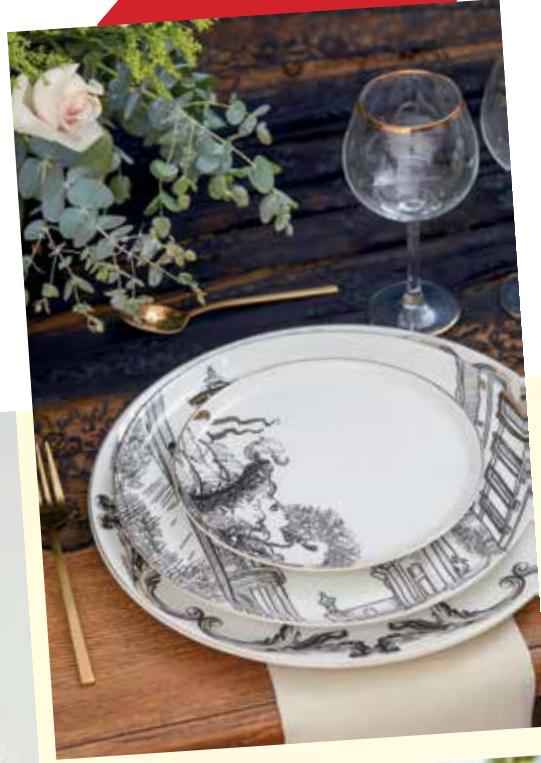
Marie Antoinette dinnerware Porland