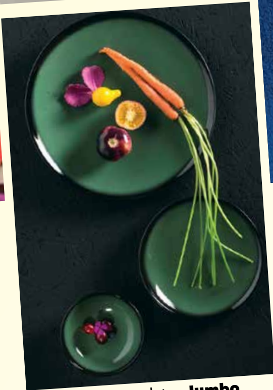
Joy green plates Jumbo