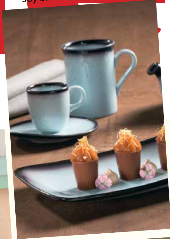
Joy breakfast set Jumbo