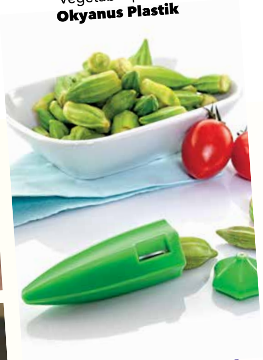
Vegetable peeler Okyanus Plastik