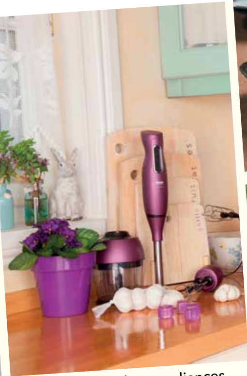
Electrical kitchen appliances Fakir