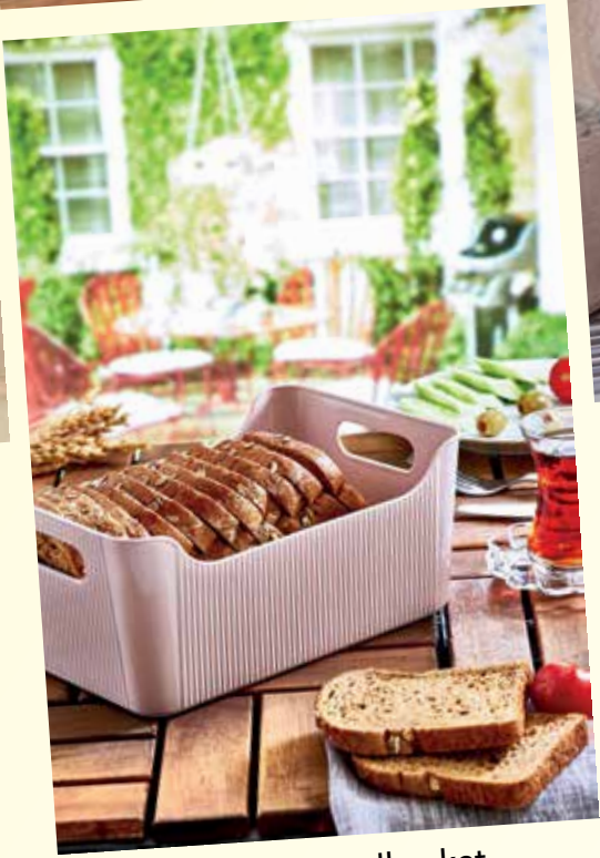
Plastic breadbasket Okyanus Plastik