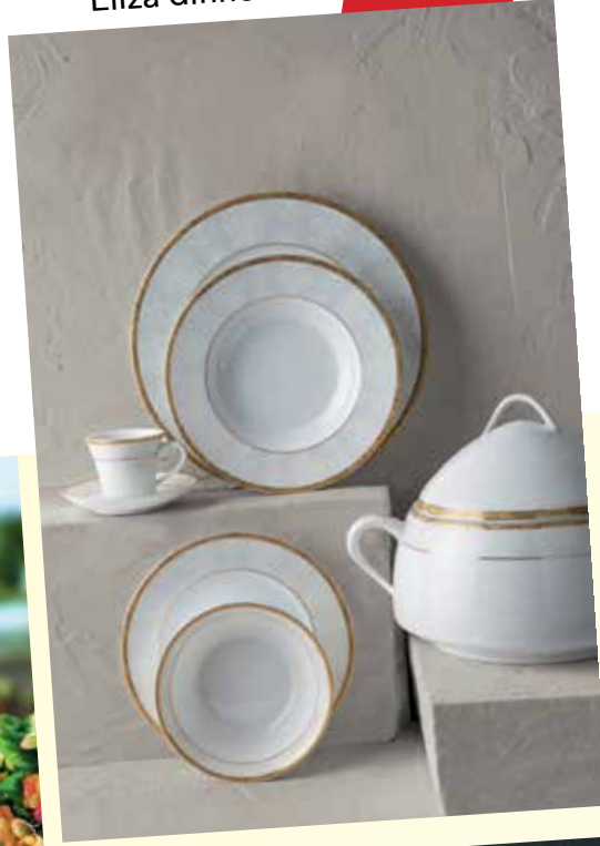
Eliza dinnerware Emsan