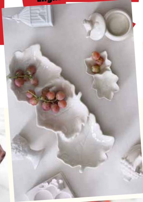
Porcelain breakfast set English Home