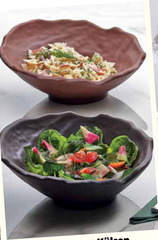
Appetizer set Külsan