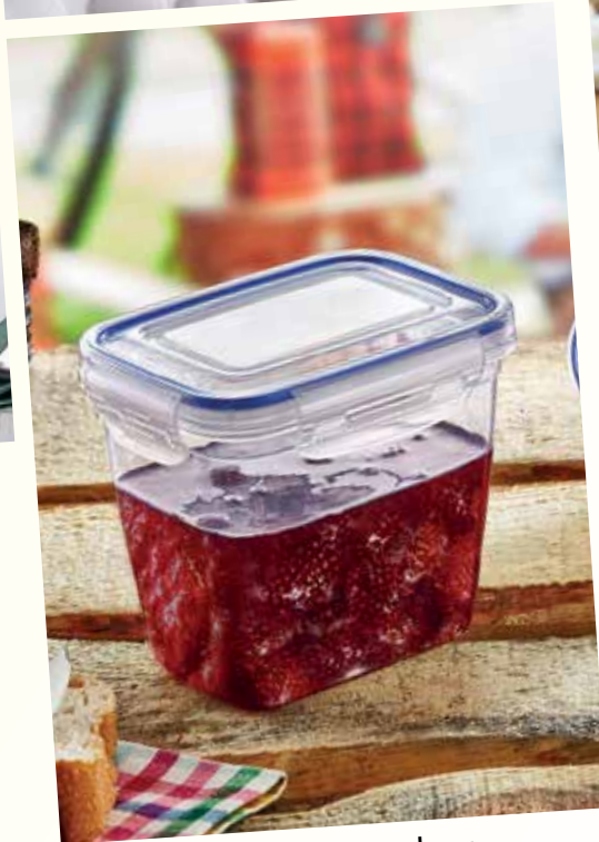
Plastic storage box Dünya Plastik