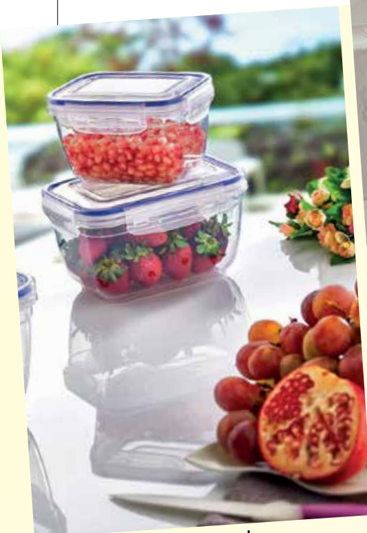
Plastic storage boxes Dünya Plastik