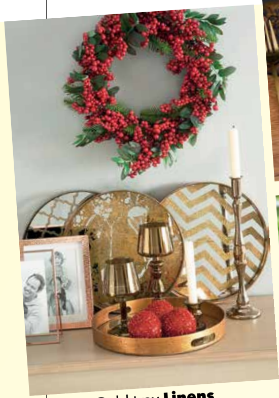
Gold tray Linens