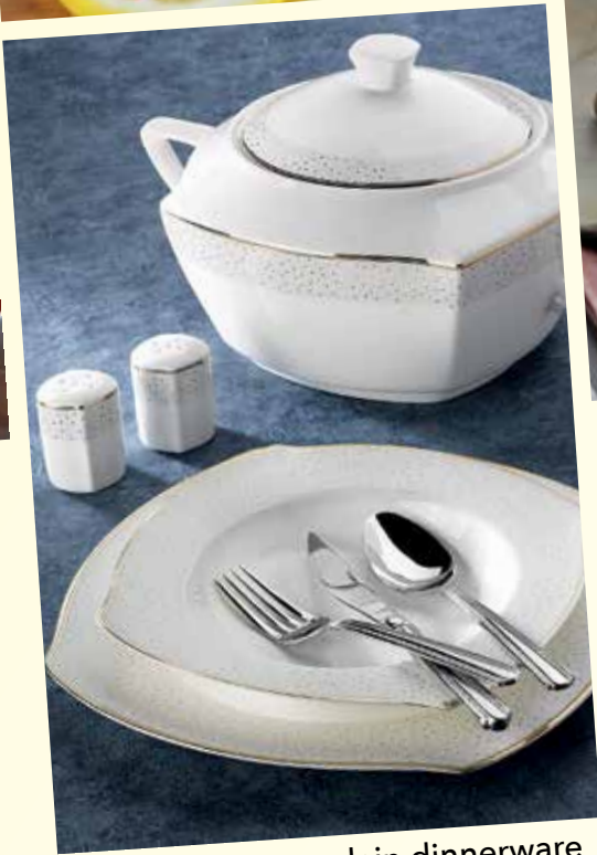
Samanyolu porcelain dinnerware Emsan