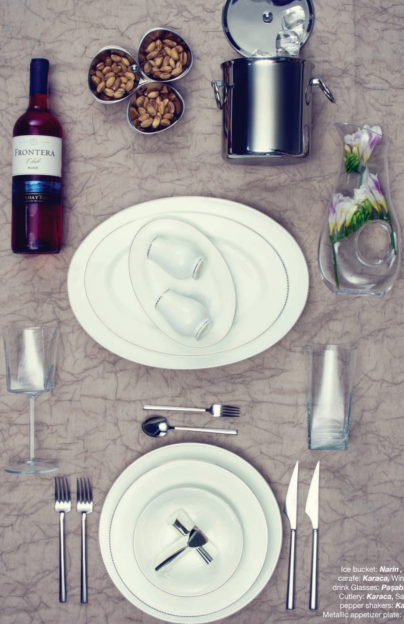
Ice bucket: Narin , Glass carafe: Karaca , Wine and drink Glasses: Paşabahçe , Cutlery: Karaca , Salt and pepper shakers: Karaca , Metallic appetizer plate: Narin