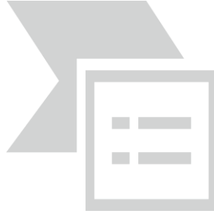
Kimberly A. Reed President and Chairman EXIM